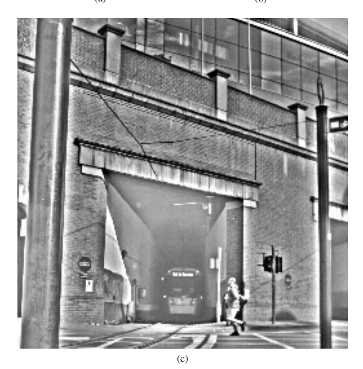
Fig. 2. An example where a pedestrian can be seen in the underexposed setting in (a) but not in an over-exposed setting (b) which helps to see the coming tram. Only with the HDR frame (c) both the pedestrian and the tram can be seen.

a low-light setting because of the long exposure time needed due to the relatively low sensitivity and small fill factor of the photodiode on this vision-chip [2]. This is not a restriction of the HDR tone mapping algorithm but rather a limitation in the design of the current vision-chip prototype.